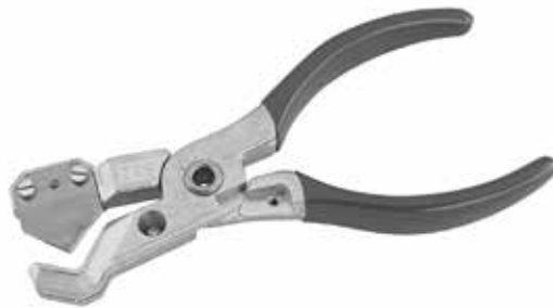
Corrugated Tube Plier with 3 spare blades