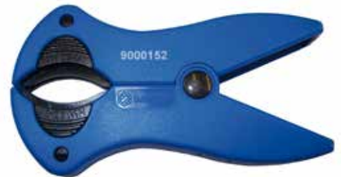
Universal cutting pliers for unslited corrugated