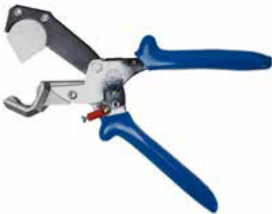
Cutting pliers for slited corrugated tube UFW