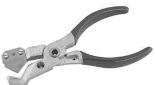
Corrugated Tube Plier with 3 spare blades