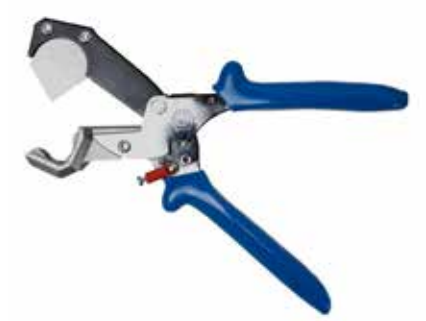
Cutting pliers for slited corrugated tube UFW