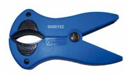
Universal cutting pliers for unslited corrugated